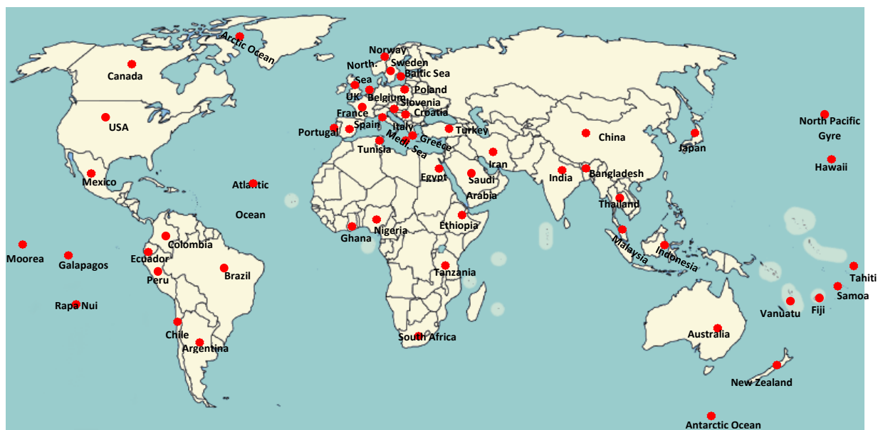
Fig. 1. Global map showing the 56 locations/countries (red dots) where 887 fish species were found contaminated with MPs. The number of fish species contaminated with MPs at 56 locations/countries and identified in the above map was based on the 208 references.

number of fish species contaminated with MPs than previous studies. For example, this study found 887 fish species ingested or were contaminated with MPs, while much lower MPs contaminated fish species were reported by Jabeen et al. (2017) (150), Markic et al. (2020) (322), Azevedo-Santos et al. (2019) (427) and recently by Wotton et al. (2021b) (506). The current study's findings of a much higher number of MPs contaminated fish species may be linked to the following facts: i) More plastics pollution occurring in recent times in the marine, brackish, and freshwater environments due to mismanagement of plastic waste; ii) More research is being done on MPs contamination of fish and seafood species across the globe; and iii) More research results are available to the general public via open-access journal papers and social media (Twitter, Facebook, Instagram).