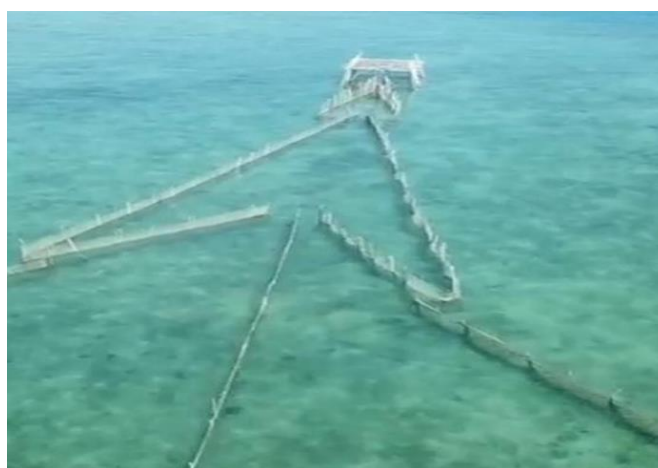
Fig. 2. Aerial picture of fixed stake trap constructed with the use of PVC pipes and mesh net.

The fixed stake trap unit was monitored for its robustness. The catch data from the newly constructed fixed stake trap was recorded daily for 5 months. Although besides white-spotted spinefoot, there were other fish species caught in Karang-karangan, but they were insignificant in numbers. In addition, 25 fishers were interviewed for feedback on PVC pipes for fixed stake trap construction and operation and the mesh size change.