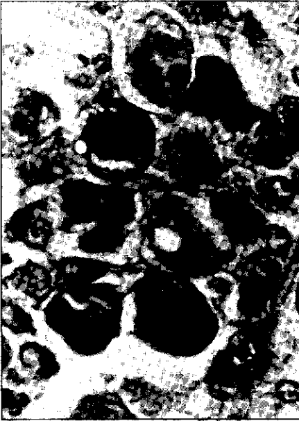
Fig.5. Enlarged view of a tubular lumen of hepatopancreas filled with sloughed epithelial cells and viral occlusions (H&E, X 1,000).