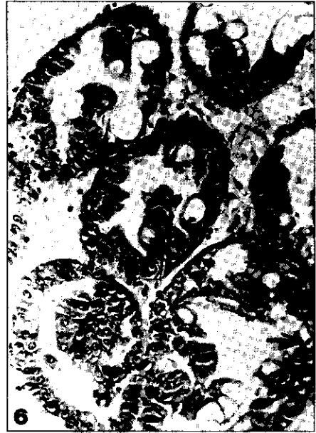
Fig.6. Hepatopancreatic tubules showing hypertrophied nuclei with marginated chromatin material (arrow) (H&E, X 250).