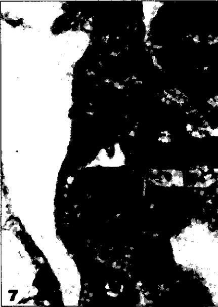
Fig.7. Enlarged view of the tubule showing the hypertrophied nucleus and viral occlusions (arrow) (H&E, X 1,000).