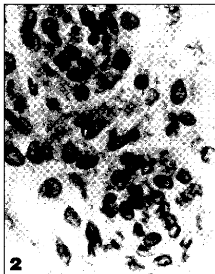
Fig.2. Histological section of lymphoid organ showing necrosis.