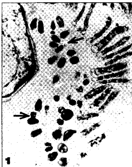
Fig.1. Histological section of gill showing epicommensal protozoan, Zoothamnium sp. (arrow) (H&E, X 100).