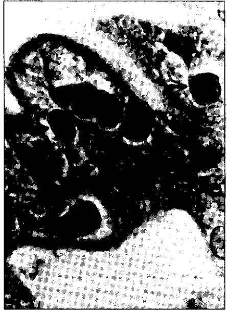
Fig.8. Enlarged view of the hypertrophied nuclei appearing as 'signet rings' (arrow) (H&E, X 1,000).