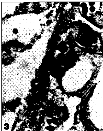
Fig.3. Tissue impression smear of hepatopancreas showing MBV occlusion bodies (arrow) (H&E, X 1,000).